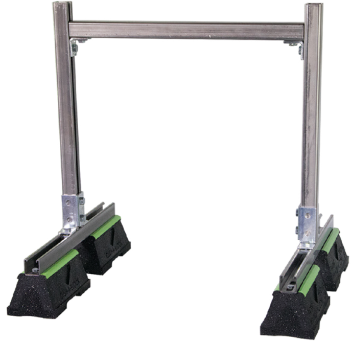
DSACBN-DSF Duct Support Series With Fixed Width & Adjustable Height