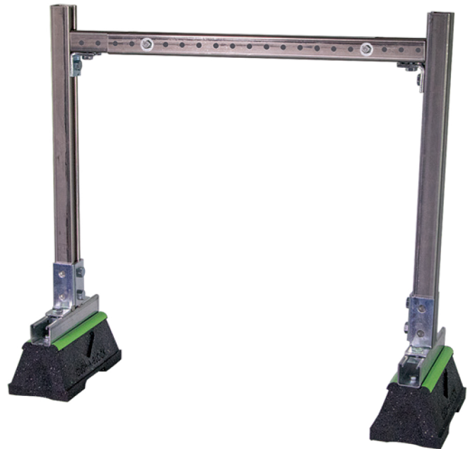
DSACBN-DS-Duct Support Series With Adjustable Width and Height